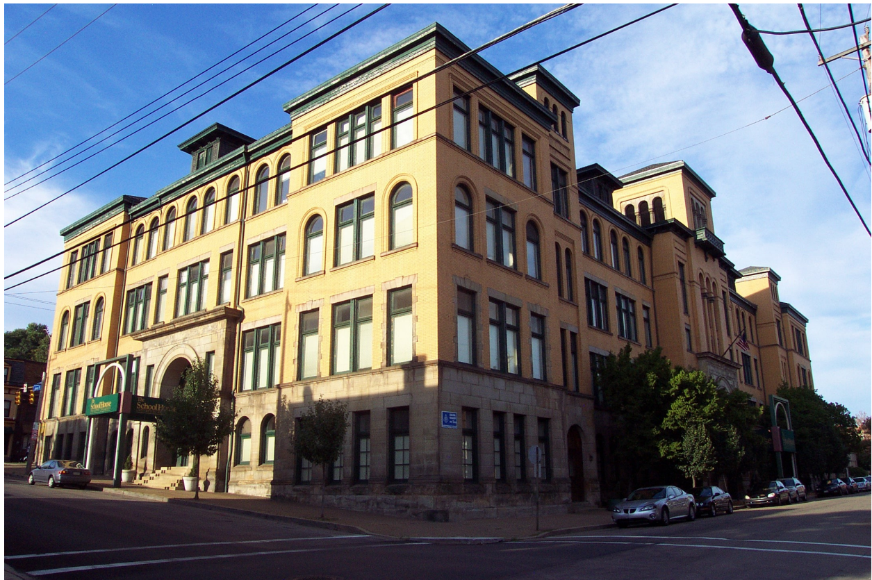
The School House Apartments, corner of Tripoli and James Streets

The large, yellow-brick building in the 500 block, on the south side of the street, was built in 1898 as the Third Ward Public School and ended its life as a school as Latimer Middle School. It is now The School House, market-rate apartments, renovated in 1985.