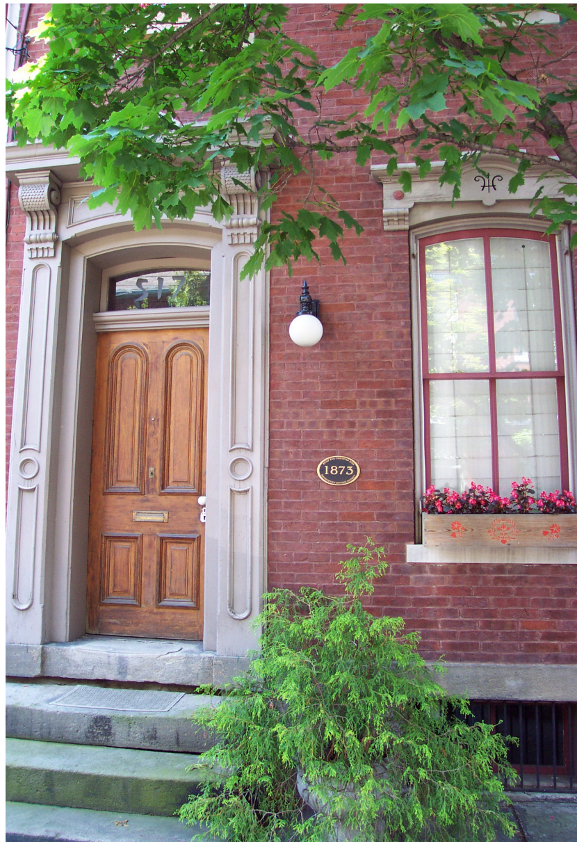
517 Avery Street

offices of the East Allegheny Community Council. This house was restored between 1979-1991 by the author, while living in it.