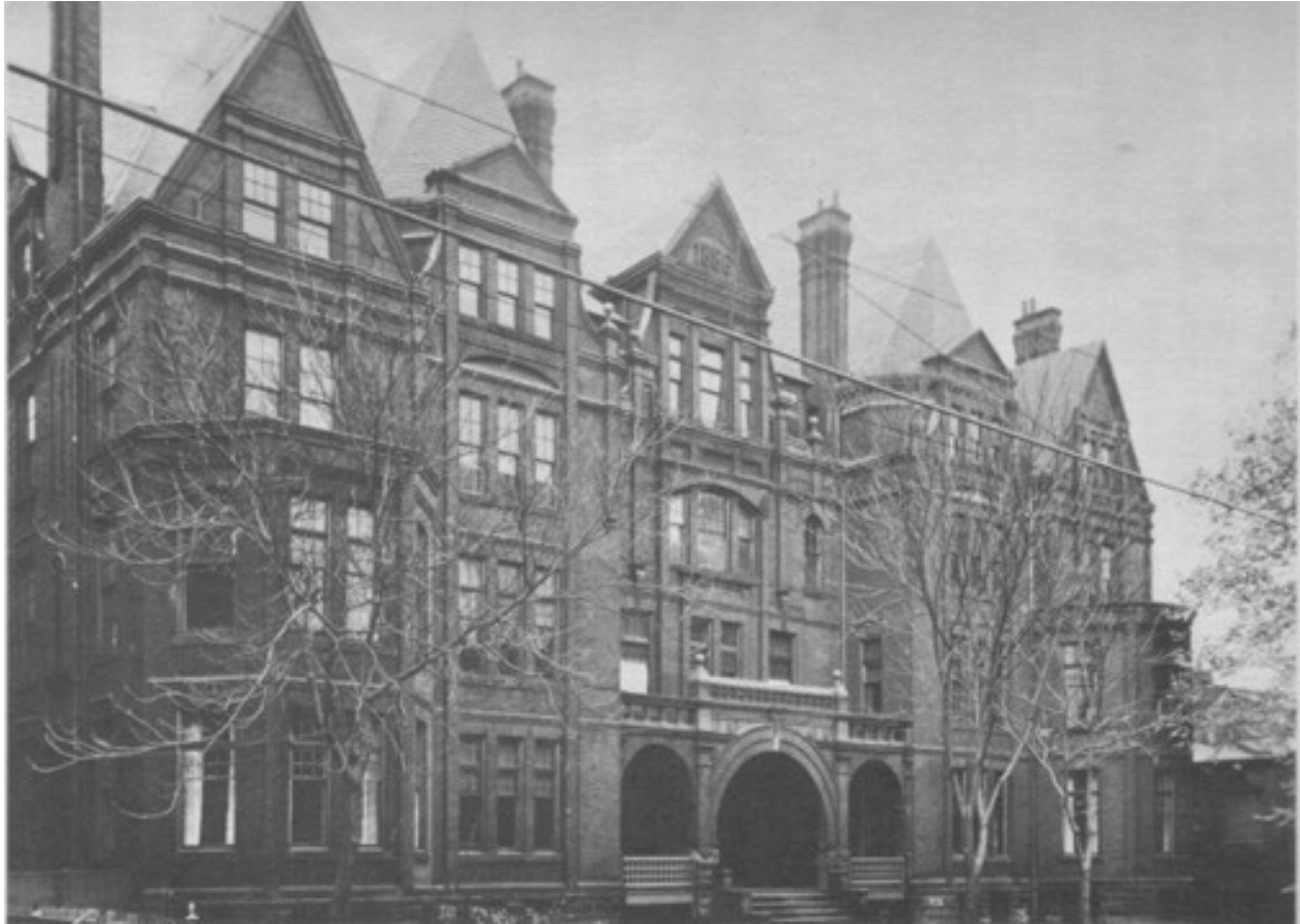
Home of the Friendless

the Friendless', 'Home for the Aged Poor', 'Little Sisters of the Poor' and the stables and storage facility for Boggs and Buhl department store.