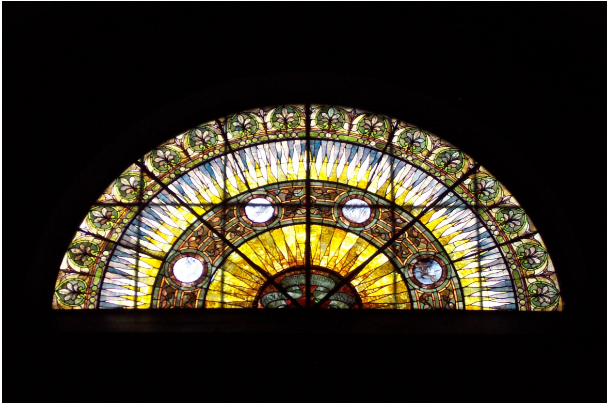
One of the original 1854 lunette windows in the former St. Mary's German Catholic Church

At the end of Lockhart, on the south side, is St. Mary's German Catholic Church, built in 1854, and has been restored as a reception hall for medium-size (350-550) gatherings. Its new name is Pittsburgh's Grand Hall at the Priory. It was erected at a time of strong anti-Catholic feelings and was built with only the small, high, lunette windows on the front and sides and a rooftop skylight. The front entry vestibule was added in 1900 and the present, stained-glass windows on the sides were added in 1911.