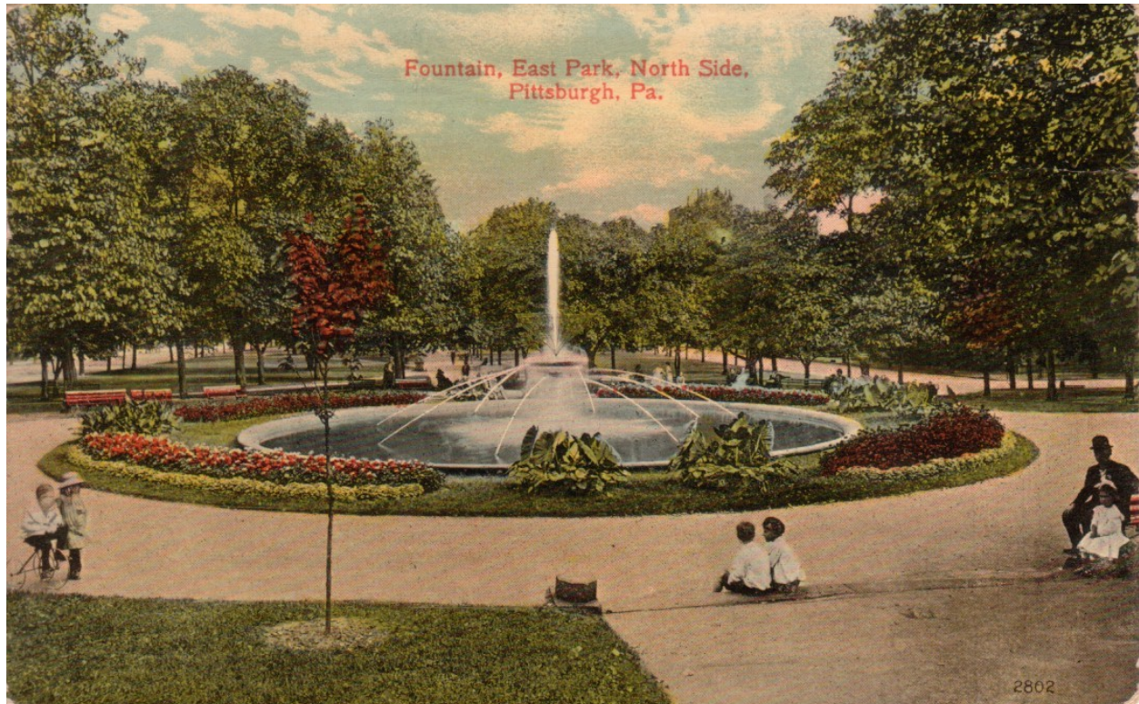
East Park Fountain, corner Cedar Avenue and North Avenue, from a post card printed by I. Robbins & Son, Pittsburgh, PA, circa 1919

Below is an old post card showing the fountain in East Commons right across the street from Allegheny General Hospital, at the corner of Cedar Avenue and North Avenue.