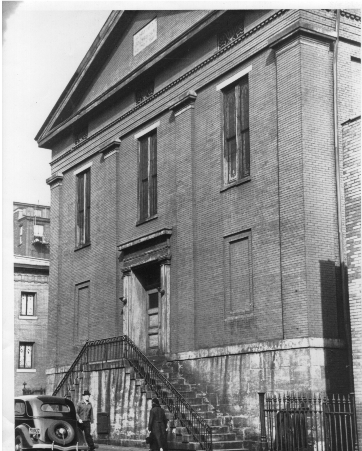
Avery Institute, Nash Street, Carnegie Library photo

On this street lived many merchants who owned businesses on East Ohio Street. Most of the houses were built in the 1860s and 1870s in the Italianate style, with decorative window hoods and large box gutters with decorative brackets underneath. On the NW corner is a house that, at one time, included Gum's Meat Market, with the owner living above the store.