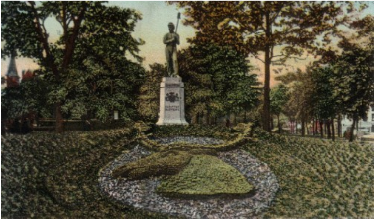
Hampton Battery Monument, East Commons, from a post card of unknown date by the Pittsburg News Company

The Commons was originally used as pasture for livestock but in the 1840s and 50s, it became the site of squatters' dwellings. Beginning in 1867, however, the City created a formal park which was completed in 1876. The framework remains with us today. There are plans in place to restore the Commons to its original design and a pilot project has begun in the section from the Hampton Battery to Cedar Avenue with new path paving, trees, and path lights.