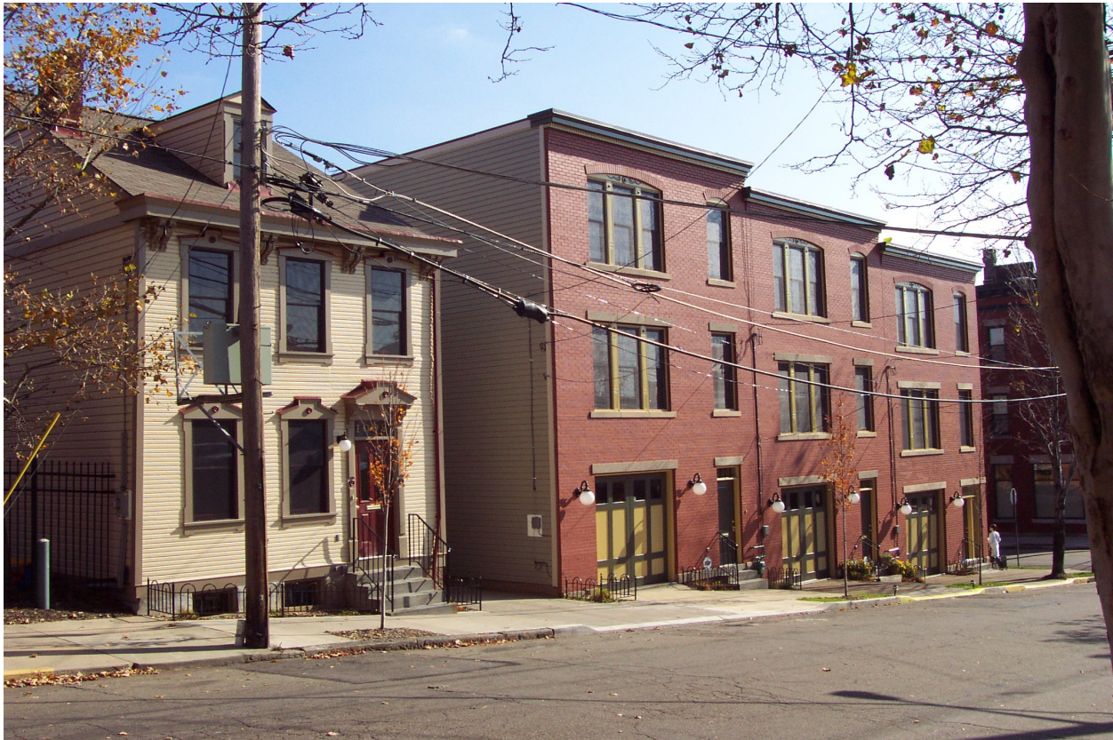
1008-1000 Middle Street

Continue walking south on Middle Street after crossing Tripoli Street. The three new houses at 912-916 Middle Street (the three houses on the left in the picture below) were built in 1996 by EACC. They replaced two double houses containing mill workers' flats which were deemed structurally unsound and demolished. 910 Middle was restored by EACC at the same time.