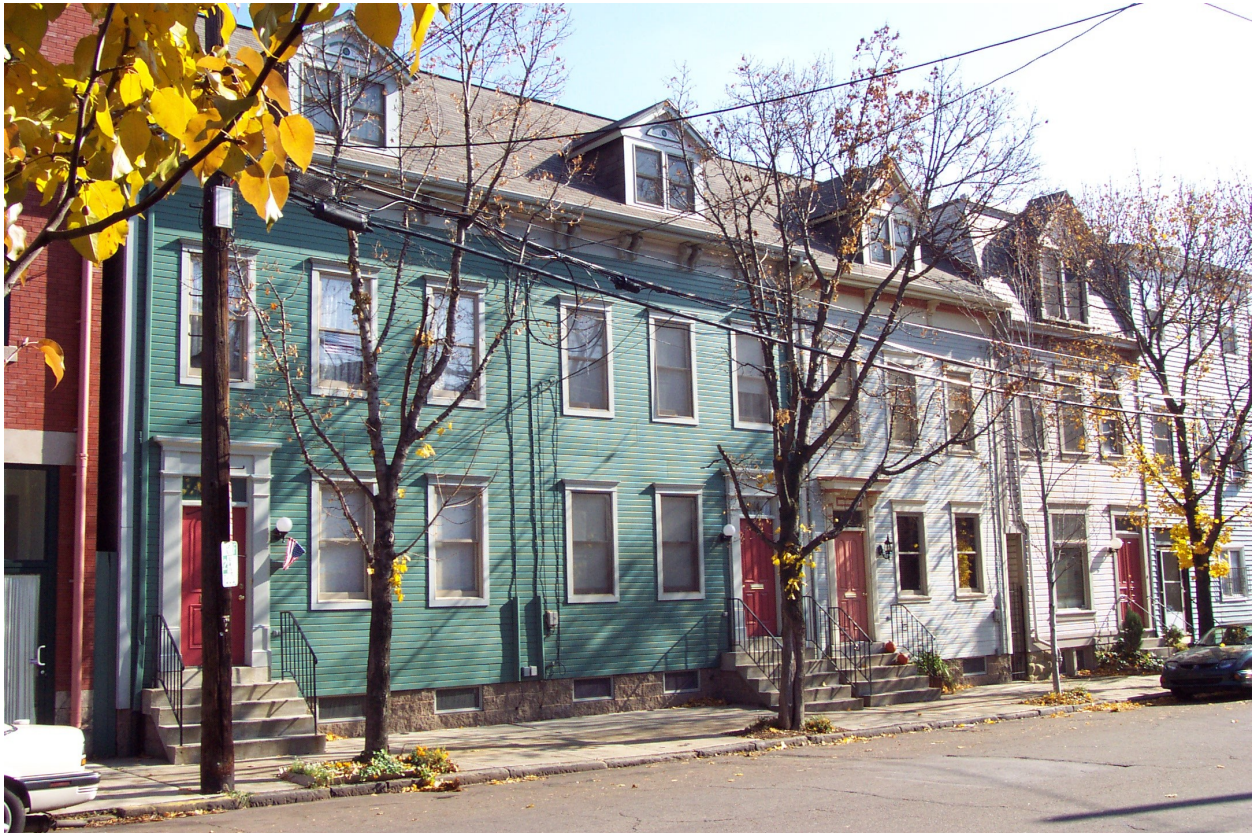
916-910 Middle Street