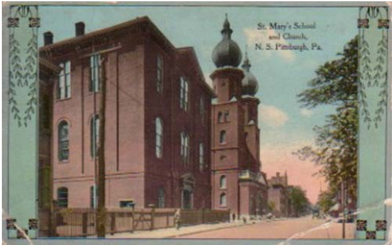
St. Mary's School and Church, looking West on Lockhart Street, from a post card of 1916