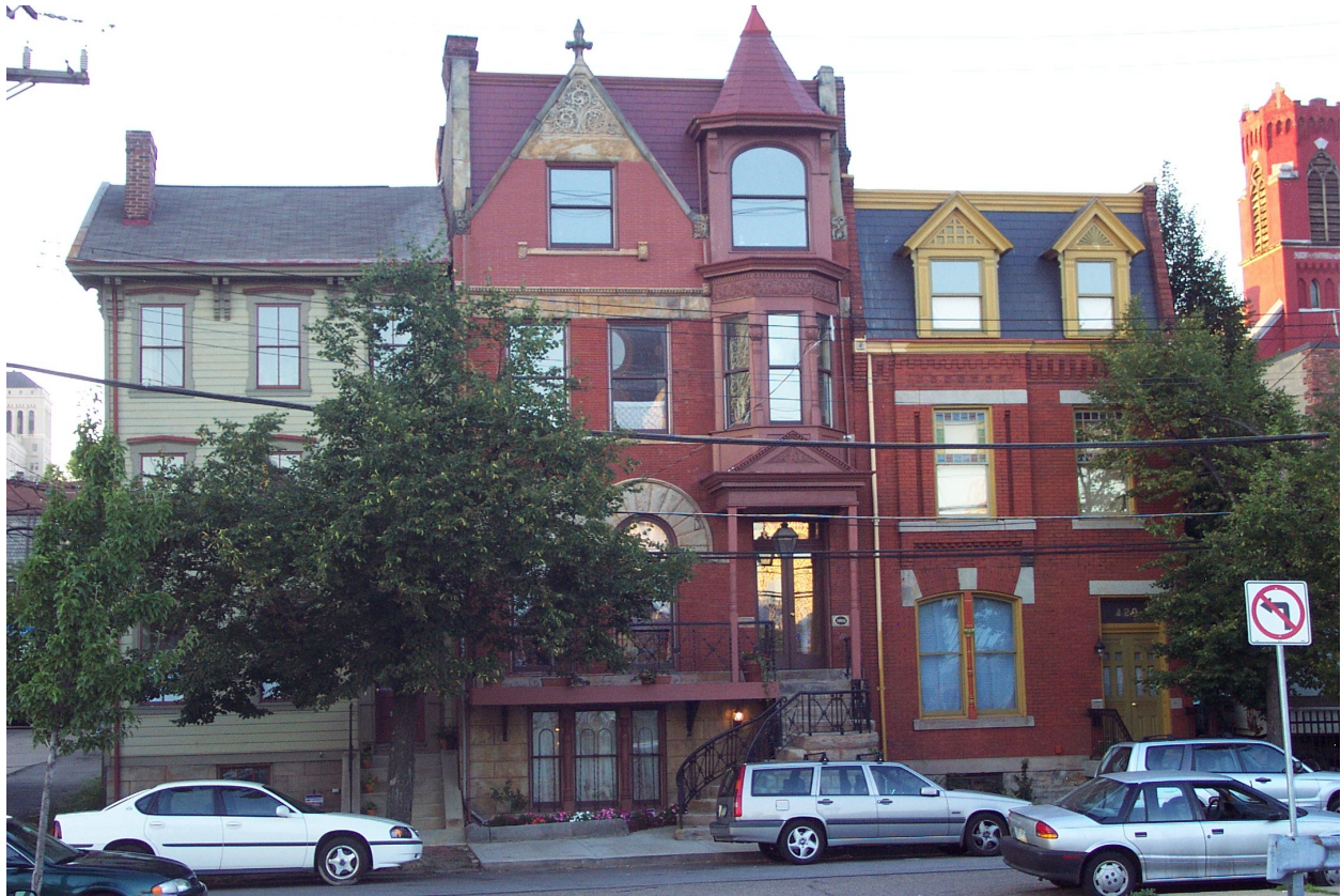
416, 418, and 420 Pressley Street