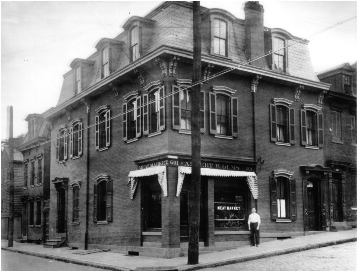
Albert W. Gum's Meat Market, 601 Nash Street